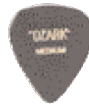
3431 Teardrop shape